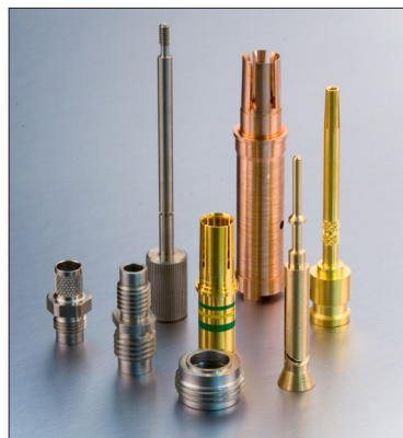
Contacts and Bodies