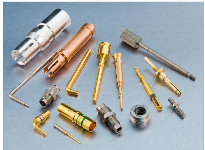
Contacts and Sub-Assemblies

Contact us to learn more about the products and services available from Futuristics Components and RAF Electronic Hardware: (203) 888-2133 • www.futuristicscomponents.com • www.rafhdwe.com