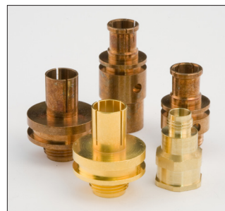
Outer Contact Bodies

Empowering innovation. Engineering value.