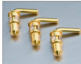
Right Angle Contacts