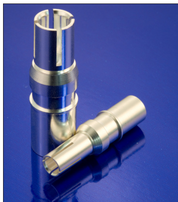
.750 Capacity Connectors